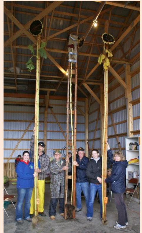
Tall Sunflowers at Wellington Pumpkinfest 2011