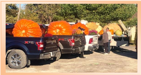
885 Langridge 19 est, 888.5 Langridge 19, 804.5 Langridge EXH

You can mix and match any 6 of the below seeds (max 2 of any one seed), for $65.00 Canadian funds, plus $5 per order shipping and handling for a total of $70 Canadian Funds. (55.00 USD). Outside of North America. Please add an additional $5 postage ($70 CDN Total) For US customers, if you would like premium shipping with tracking the total is $65 USD)